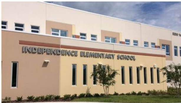
Independence Elementary school, which opened in 2015 in Horizon West

The budget for the new middle school that will relieve crowding at Bridgewater, plus two other new elementary schools in Horizon West. That new middle school, under construction on Tarrant Road, and the new elementary schools all are to open in August. The new elementary schools aim to reduce crowding at other nearby campuses, including Keene's Crossing and Independence elementary schools.