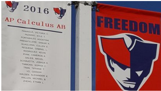
Courtyard banners at Freedom High School, which has an enrollment that tops 3,900. It is to get relief when a new high school opens in 2022.

two largest high schools. By the time the new school is to open, enrollment projections show both high schools will be educating more than 4,100 teenagers each, with Freedom at nearly 4,400. Freedom's campus, off south Orange Blossom Trail, was built for 2,600 students.