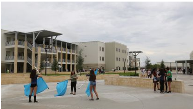
Windermere High School, which opened in 2017, is getting crowded already. A new high school, to be built in Horizon West, is expected to help when it opens in 2022.

The projected student enrollment at Windermere High School by 2022. Orange's newest high school opened in 2017 as a relief school for West Orange High School. But it is getting crowded so the other new high school to open in 2022 — one to be built in Horizon West — will be its relief school. Windermere High's enrollment is now more than 3,300 students on a campus meant for 2,750.