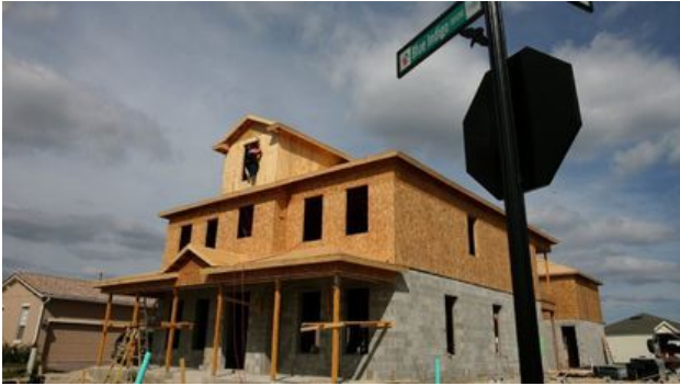
A home under construction in Horizon West in 2006.

Percentage of county land that Horizon West takes up — and percentage of 2017 Orange residential building permits filed for Horizon West homes, according to Orange County government figures. That explains why schools in that community are filling so quickly.